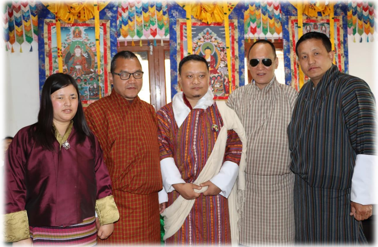
Figure 12 Glimpse of New Acting Executive Director with the Board of Directors during the appointment ceremony of Executive Director of DPOB