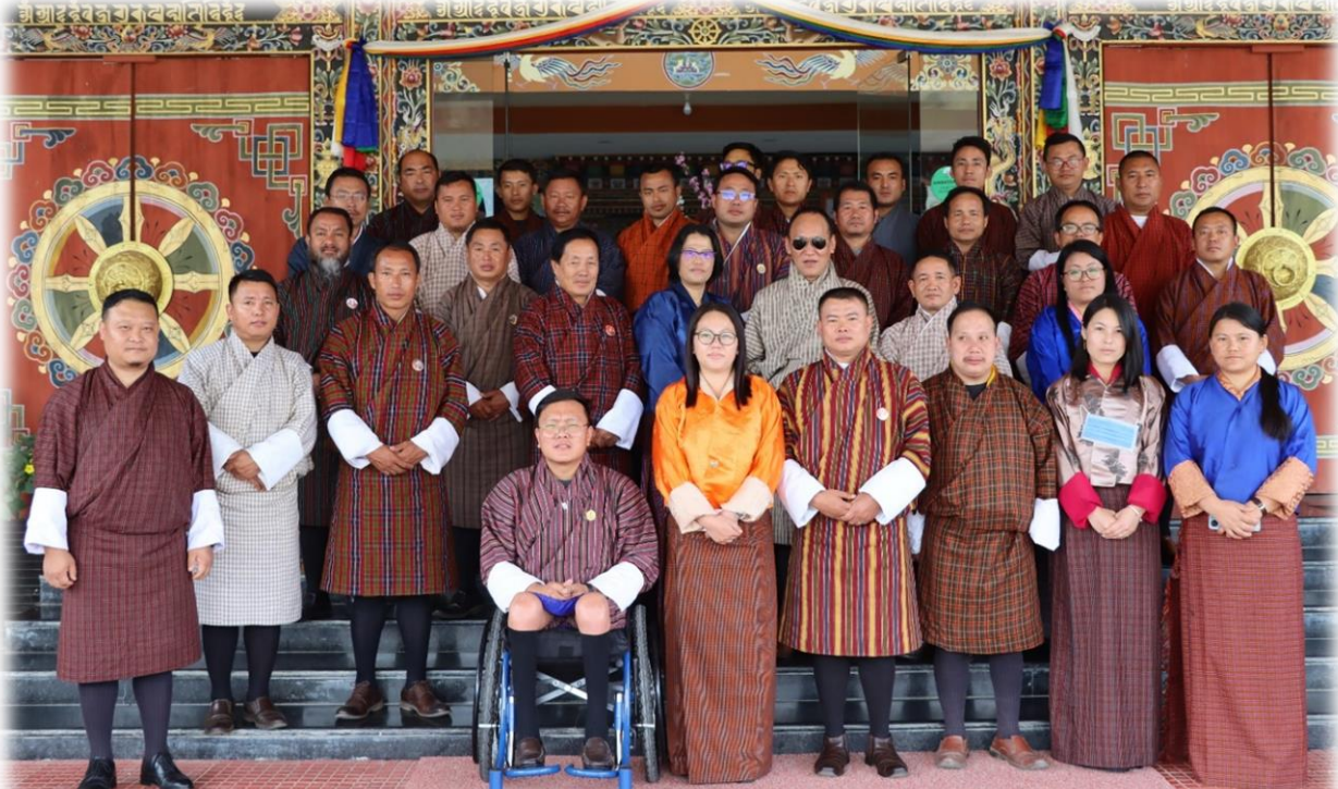
Figure 6 Group photo with the district and local leaders of Eastern Region (Trashigang, Mongar, Tashi Yangtse, Lhuentse, Samdrup Jongkhar & Pema Gatsel)

The national policy for persons with disabilities serves as a crucial framework delineating the rights and requirements of individuals with disabilities across key domains such as education, employment, healthcare, and accessibility. Anchored in the principles of the United Nations Convention on the Rights of Persons with Disabilities (UNCRPD), this policy underscores the imperative for nations to ensure the full societal integration of persons with disabilities. In a concerted effort to effectively implement this national policy, the Disabled People’s Organization of Bhutan (DPOB), with generous support from UNICEF, has conducted a successful orientation program aimed at district sector heads in ten Dzongkhags, spanning the Eastern and Central regions. This orientation, coupled with a Disability Equality Training (DET)