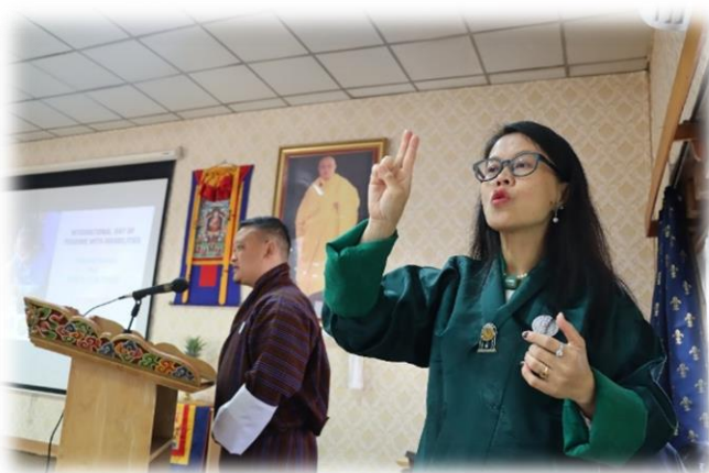
Figure 34 Executive Director of DPOB with Sign Language Interpreter during the Event of IDPD

The International Day for Persons with Disabilities is celebrated globally on 3 December every year to promote the rights and well-being of persons with disabilities at every level of society and raise awareness of their situation. This year DPOB launched a Tiktok challenge, “Dra-Nyam: Equity and Accessibility for all” to create awareness on equity, accessibility and inclusion of Person with Disabilities in all the aspects of life. DPOB awarded excited prizes of Nu 15,000/-, 10,000/-, 5,000/- to the top three.