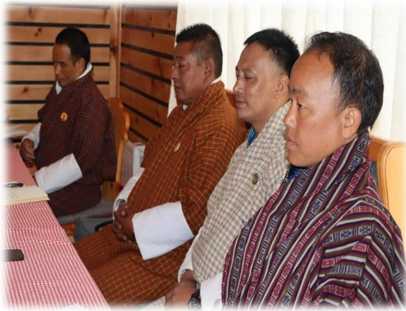
Figure 7 Glimpse of Dasho Dzongdas and City Mayor during orientation on national policy for persons with disabilities in Bumthang.

The national policy for persons with disabilities serves as a crucial framework delineating the rights and requirements of individuals with disabilities across key domains such as education, employment, healthcare, and accessibility. Anchored in the principles of the United Nations Convention on the Rights of Persons with Disabilities (UNCRPD), this policy underscores the imperative for nations to ensure the full societal integration of persons with disabilities. In a concerted effort to effectively implement this national policy, the Disabled People’s Organization of Bhutan (DPOB), with generous support from UNICEF, has conducted a successful orientation program aimed at district sector heads in ten Dzongkhags, spanning the Eastern and Central regions. This orientation, coupled with a Disability Equality Training (DET)