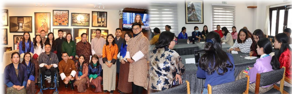
Figure 21 DET to the Training institutes & Management and Facility Members of UN Agencies in Bhutan respectively

DPOB conducts systematic advocacy to improve outcomes for all persons with disabilities in Bhutan by attempting to influence longer-term change to ensure that their rights are respected. To defend these rights and interests, we influence and change systems such as law, rules, and