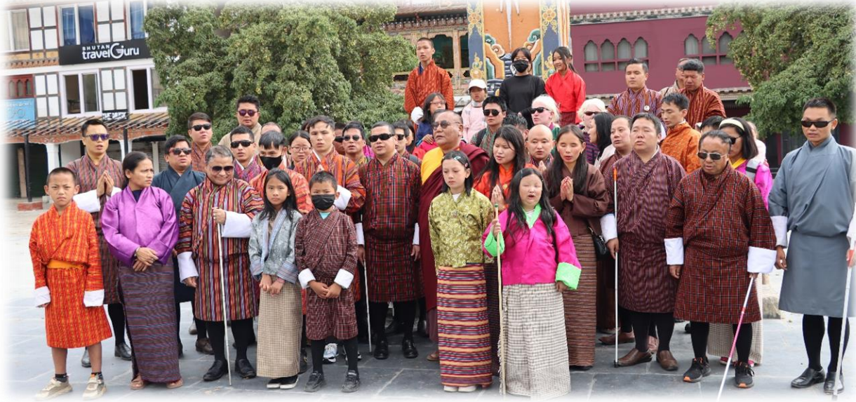
Figure 33 Group photo of persons with blindness celebrating international white cane safety day 2023