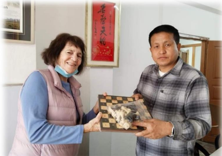
Figure 19 DPOB Received 28 Chess Boards from Bhutan Foundation.

The Bhutan Foundation generously provided financial support to procure 28 accessible chessboards from Chess House, USA. These specially designed chessboards are equipped with features to accommodate individuals with disabilities, ensuring equal access and participation in the game. The primary objective of the donation is to promote sports participation among individuals with disabilities and provide them with opportunities for recreational and competitive engagement.