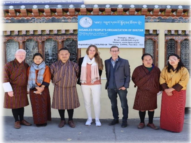
Figure 30 Management team with Normisjon Officials during Project Monitoring Visit.

Bhutan (DPOB) chaired the meeting, which brought together representatives from each of the participating organizations. The primary objective of the coordination meeting was to strengthen collaboration among OPDs in Bhutan. The meeting aimed to identify areas of common interest and explore opportunities for joint initiatives to support persons with disabilities. All six organizations present at the meeting are legally registered under the Civil Society Organizations Authority.