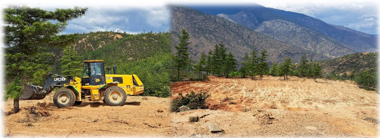
Figure 14 Glimpses of successful completion of landscaping DPOB Centre

The Officials from the Dantak Office visited to the DPO Center at Yoezerkha, under Wang gewog under Thimphu Dzongkhag. The primary purpose of the visit was to assess the progress of the DPO Center site and evaluate the landscaping initiatives undertaken by the Disabled People's Organization of Bhutan (DPOB). The officials conducted a thorough inspection of the DPO Center site to evaluate the landscaping efforts and ensure compliance with the project requirements.