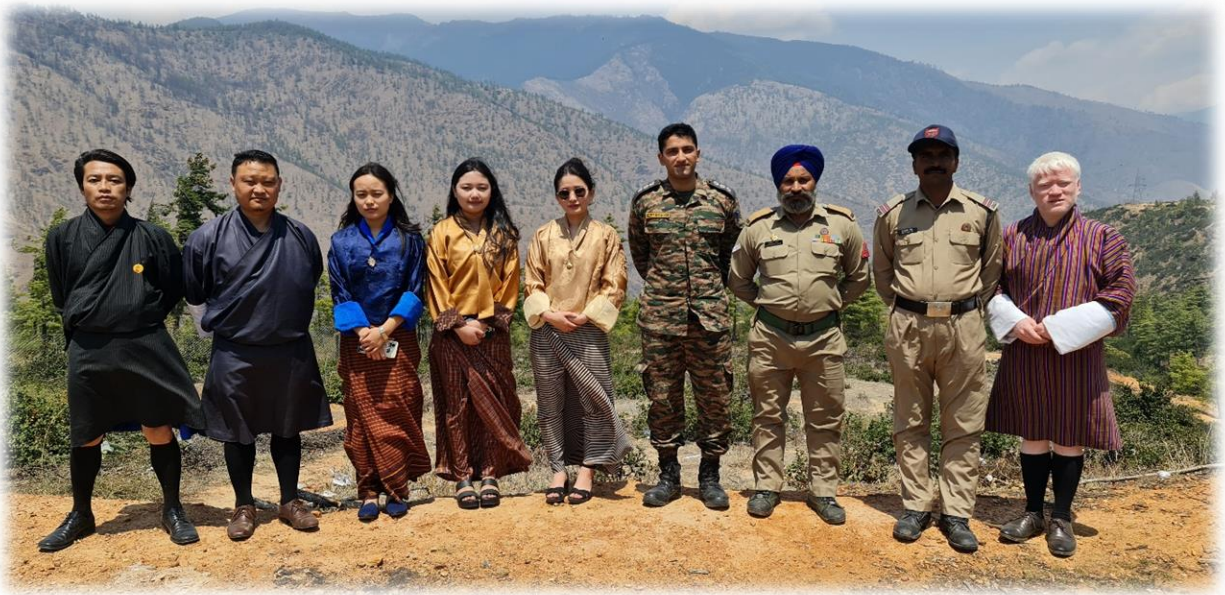
Figure 13 Management team with the Dantak Officials at DPOB Centre site for evaluating the landscaping of DPOB Centre.

The Officials from the Dantak Office visited to the DPO Center at Yoezerkha, under Wang gewog under Thimphu Dzongkhag. The primary purpose of the visit was to assess the progress of the DPO Center site and evaluate the landscaping initiatives undertaken by the Disabled People's Organization of Bhutan (DPOB). The officials conducted a thorough inspection of the DPO Center site to evaluate the landscaping efforts and ensure compliance with the project requirements.