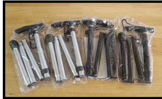
Figure 25 Air Mattress & White Cane