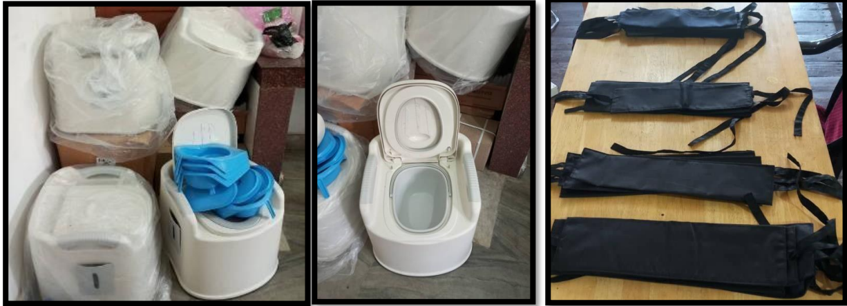
Figure 28 Portable Toilets and Blindfolds.

The provision of assistive devices has significantly empowered more than hundred individual PWDs, enabling them to navigate daily life with greater independence. Capacity-building initiatives have equipped individual beneficiaries and their caregivers with the necessary knowledge and skills, fostering a sense of equality in rights and responsibilities. The resource development activities have elevated the organization's capacity to deliver better services, ensuring sustained support for PWDs.