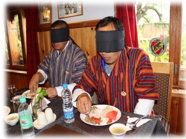
Figure 9 Participants experiencing of eating meals through blind folded.

program, equipped officials—comprising Dasho Dzungda, education officers, health officers, chief engineers, human resource officers, and local government leaders—with comprehensive insights into the policy and its pivotal provisions. Facilitated by experts in disability rights and individuals with lived experiences, the program encompassed both theoretical discourse and hands-on sessions. Participants were apprised of the legal and policy landscape governing disability rights within the nation, alongside elucidating the pivotal role district officials play in safeguarding the rights of individuals with disabilities.