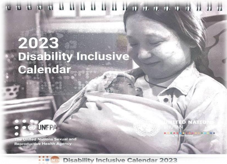
Figure 17 Disability Inclusive calendar 2023