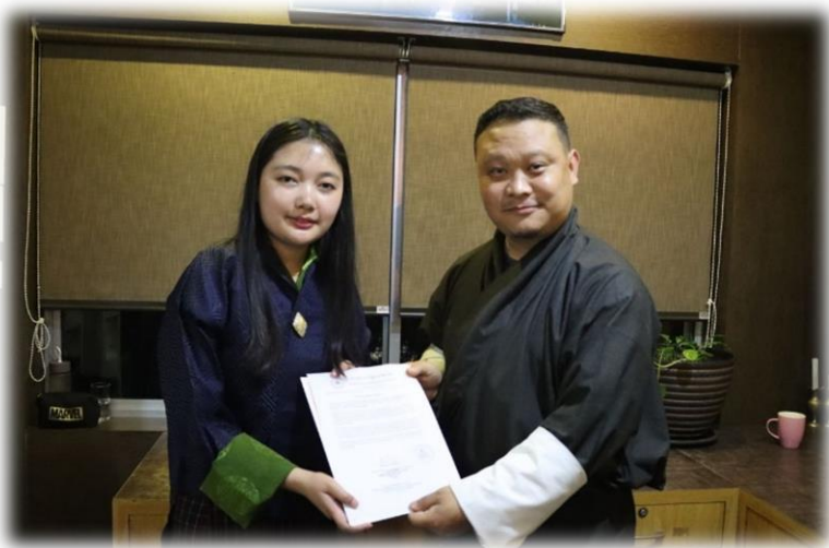
Figure 16 Executive Director awarding certificate of appreciation to the intern.

The interns have demonstrated exceptional levels of compassion and empathy towards individuals with disabilities. Their genuine concern for the well-being of our community members has been evident in their interactions and activities. Throughout their internship, the interns have displayed a strong willingness to learn and grow. They have actively sought opportunities to expand their knowledge and skills, contributing to their personal and professional development.