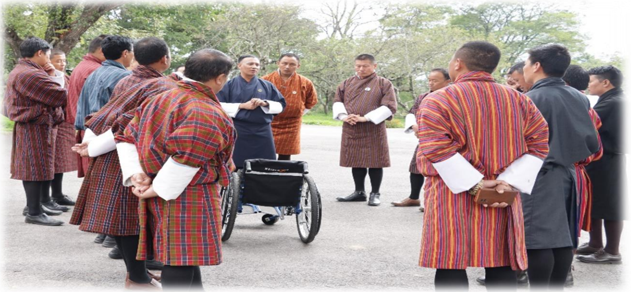
Figure 8 Participants attending practical session on how to support persons with physical disabilities who uses wheel chair.

program, equipped officials—comprising Dasho Dzungda, education officers, health officers, chief engineers, human resource officers, and local government leaders—with comprehensive insights into the policy and its pivotal provisions. Facilitated by experts in disability rights and individuals with lived experiences, the program encompassed both theoretical discourse and hands-on sessions. Participants were apprised of the legal and policy landscape governing disability rights within the nation, alongside elucidating the pivotal role district officials play in safeguarding the rights of individuals with disabilities.