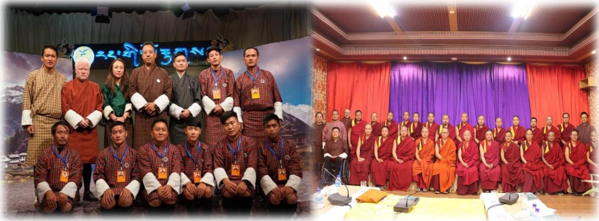
Figure 23 DET to Public show organizer/participants & the monastic institutes in Bhutan

with disabilities as the main source of information through their lived experiences. In 2023, the Organization could successfully conduct DET to the university's collages, training institutes, monastic institutes, facility members of UN agencies in Bhutan and health workers.