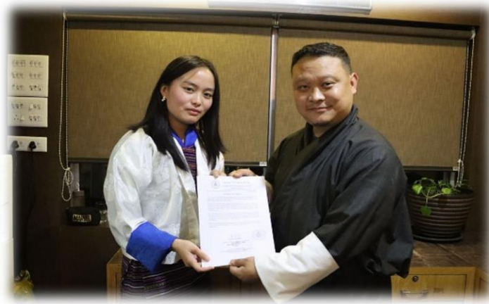
Figure 15 Executive Director awarding certificate of appreciation to the intern.

Internships play a crucial role in providing hands-on experience and fostering professional development. The interns' engagement with our organization has not only provided them with practical learning opportunities but has also enabled them to contribute meaningfully to our cause. The DPO family extends heartfelt gratitude to the interns for their dedication and commitment throughout their internship program. Their contributions have been instrumental in advancing our mission and initiatives aimed at promoting the rights and