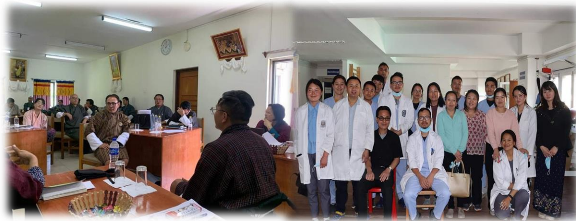
Figure 22 DET to the teachers of various Collages and health workers in Bhutan.

practices, as well as community attitudes. Raising awareness of issues affecting persons with disabilities and their families is an important component of our work. We make sure that individuals with disabilities are at the center of all discussions and decisions, because they are the greatest persons to advise on matters that affect them. We carry out the advocacy and awareness campaigns through Disability Equality Training, an approach that involves persons