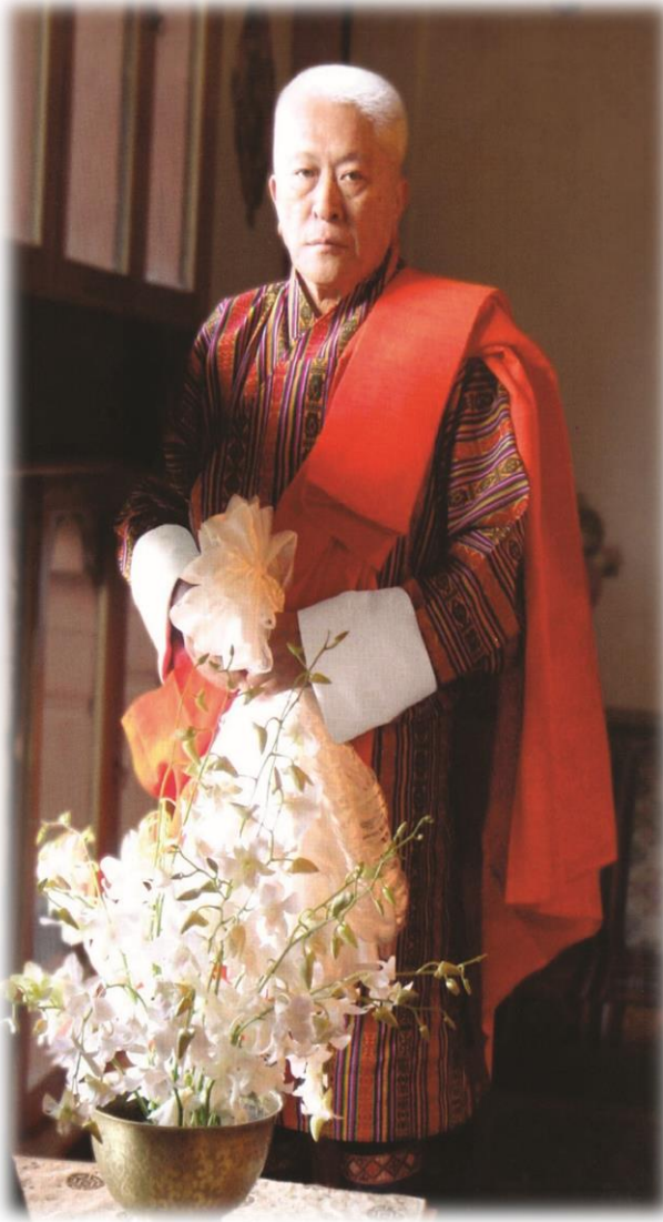
Figure 1 Royal Patronage of DPOB: His Royal Highness Prince Namgyal Wangchuk – the XXVIth Paro Penlop

The Disabled People’s Organization of Bhutan (DPOB), formerly known as the Disabled Persons’ Association of Bhutan (DPAB), was established by a group of individuals with disabilities to amplify their collective voice. With the Royal Patronage of His Royal Highness Prince Namgyal Wangchuk, the XXVIth Paro Penlop, DPOB was officially registered with the Civil Society Organizations Authority (CSOA) on November 26, 2010.