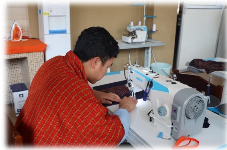
Figure 10 Participant learning Tailoring