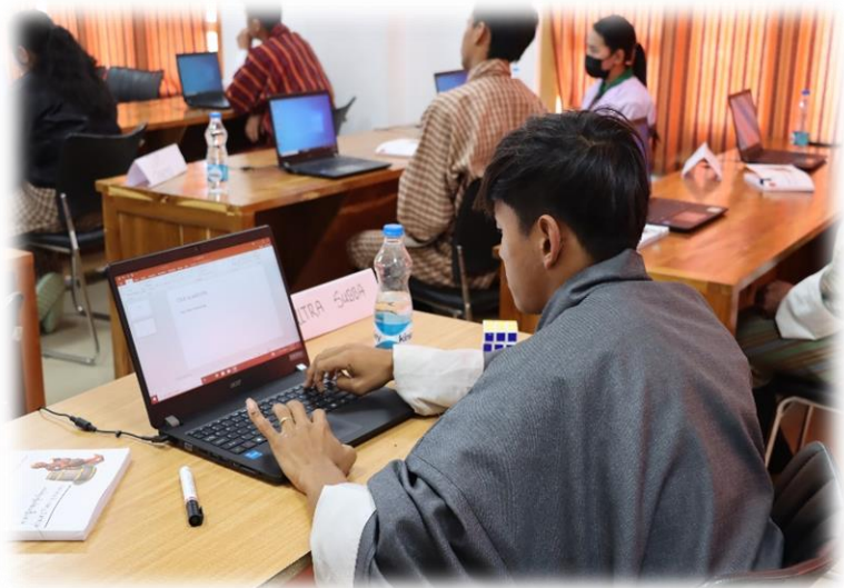
Figure 11 Participants learning ICT

Registered training institutes, namely the Institute of Advanced Tailoring and Fashion Design and Athang Training Academy, are actively involved in delivering the training curriculum. The training program was provided by the Asian Development Bank (ADB) Bhutan Resident Mission under the ADB STEP-UP Project. This funding ensures the successful implementation of the training initiative, covering various aspects such as hostel accommodation,