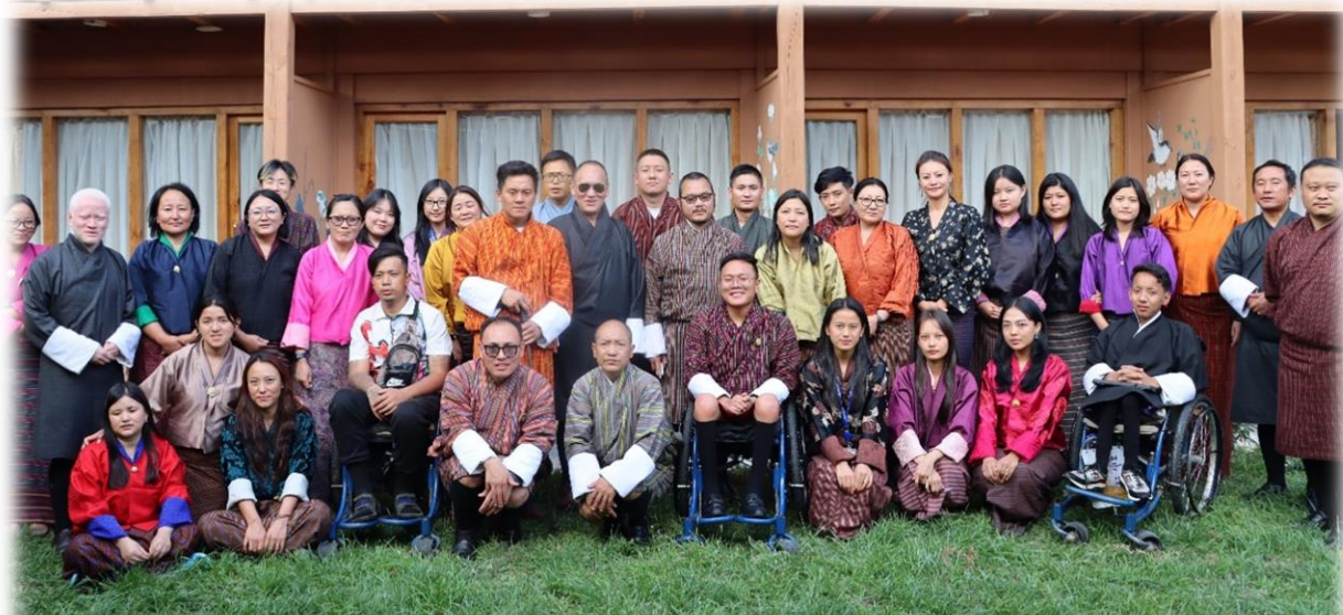
Figure 3 Group photo of persons with disabilities & other stakeholders during two-day consultation meeting on proposed reservation of United Nation Convention on Rights of Persons with Disabilities (UNCRPD), Paro.

Persons with Disabilities (UNCRPD) delivered during 9 th Session of 3 rd Parliament of Bhutan. These reservations specifically concern Articles 18, 23, 27, and 29 of the UNCRPD and have received seconding from the National Assembly. The intent behind these recommendations was to