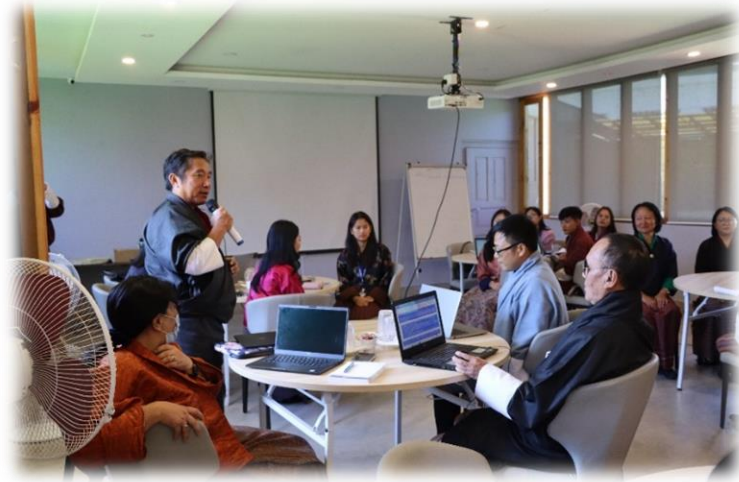
Figure 4 Participants expressing significant concerns regarding the proposed reservations of UNCRPD,

Persons with disabilities who were presented during the two days consultant workshop at Paro expressed significant concerns regarding the proposed reservations, particularly those pertaining to Articles 18, 23, 27, and 29 of the UNCRPD. They emphasized the importance of upholding the principles and provisions of the Convention without any reservations. In conclusion, the Recommendation presented by OPDs underscores the critical importance of addressing the concerns raised by persons with disabilities regarding the proposed