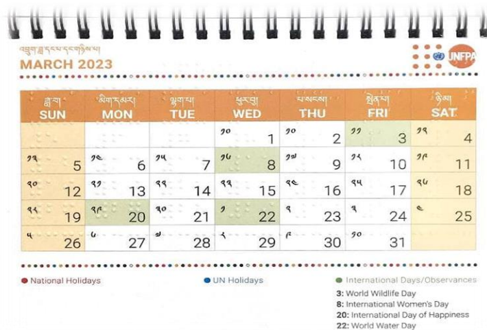
Figure 18 Disability Inclusive calendar 2023

The Disability Inclusive Calendar is designed with Braille and large print text features to ensure easy access to information for individuals with blindness and low vision. This feature enhances their ability to independently access and manage their schedules. The calendar represents a significant step towards creating an inclusive society that values the needs of all its citizens, including persons with disabilities. By providing accessible information, the calendar aims to promote the empowerment and inclusion of people with disabilities in Bhutan.