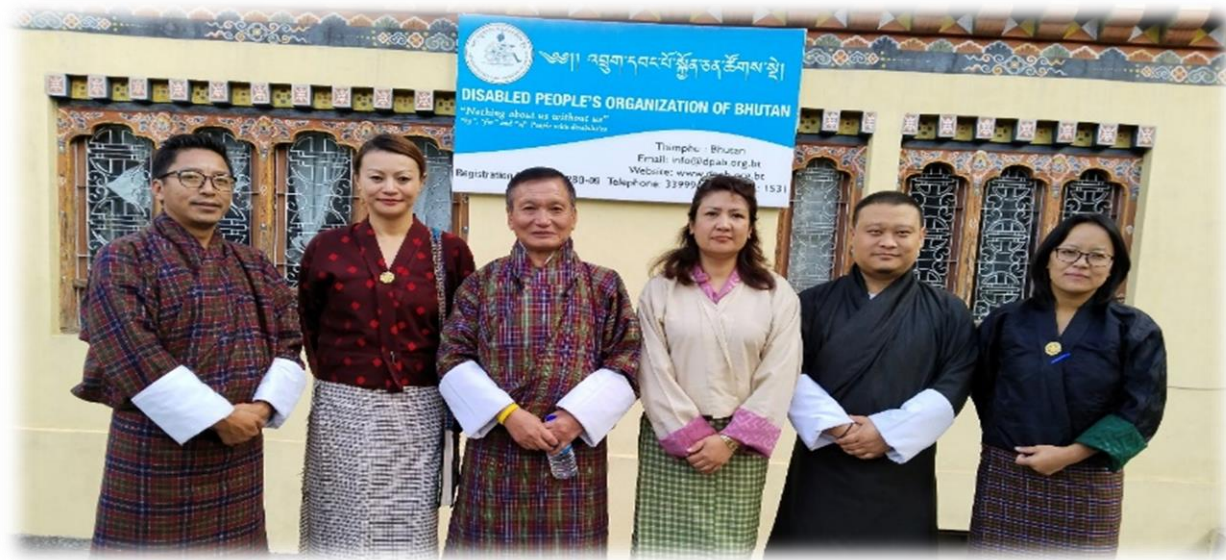
Figure 29 Group photo of OPDs leaders during Coordination meeting of OPDs in Bhutan