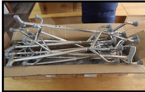
Figure 26 Elbow Crutches and Four Legs