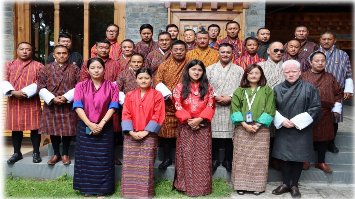
Figure 5 Group photo with the district and local leaders of Central Region (Trongsa, Bumthang, Zhemgang & Sarpang,

reservations in the National Interest Analysis for Ratification of the UNCRPD. It advocates for a thorough reconsideration of these reservations to ensure the full implementation of the Convention without compromise. By prioritizing the rights and inclusion of persons with disabilities, we can strive towards a more equitable and inclusive society for all