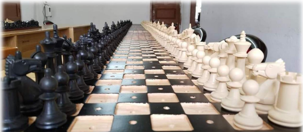
Figure 20 Accessible Chess Board for persons with disabilities

disabilities to participate fully in chess activities, fostering inclusion and empowerment within the community. Madam Jane, representing the Bhutan Foundation, officially handed over the