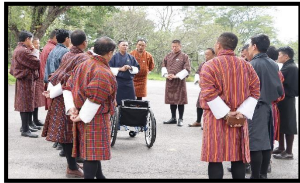
Figure 27 Wheel Chair distributed and used as a resource material during DET.