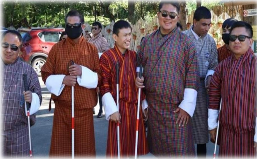
Figure 24 Persons with Blindness received white cane from DPOB

The project titled "Procurement of Assistive Device and Resource Development," undertaken by Disabled People's Organization of Bhutan with the generous support of Sykepleiernes Misjonsring. The project, executed during the agreement period from June-December 2023, aimed to empower persons with disabilities (PWDs) by providing