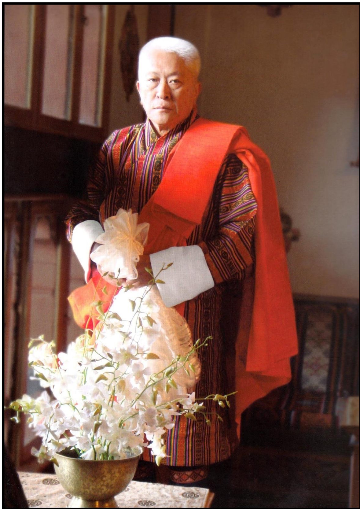
Patron-His Royal Highness Prince Namgyel Wangchuk